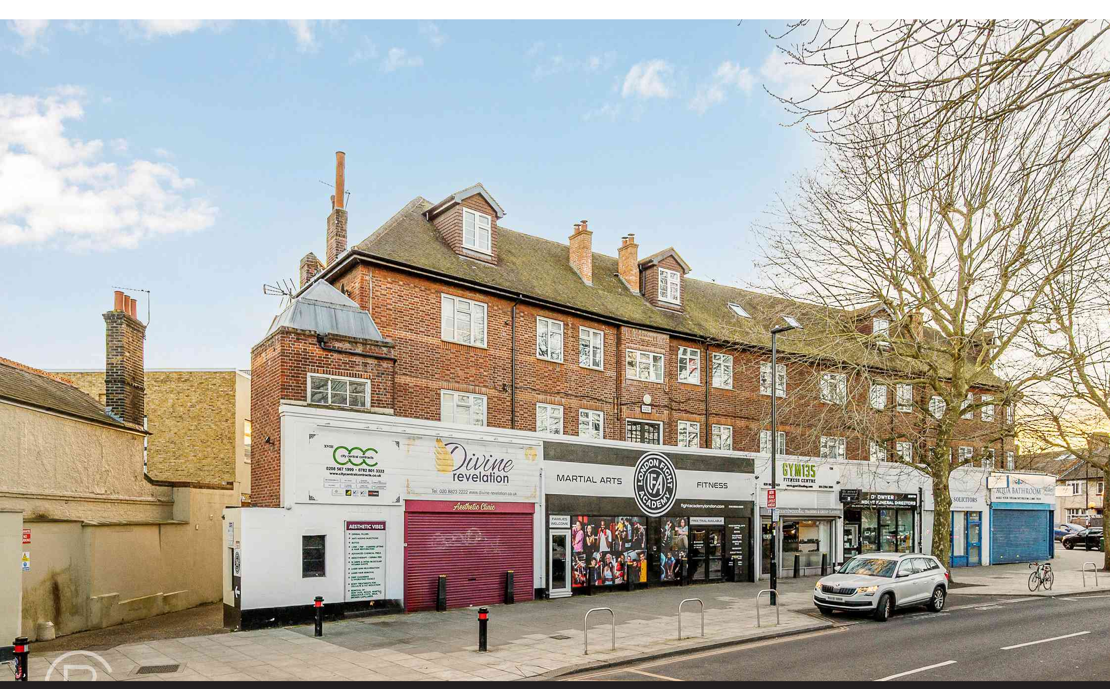
Flat 1, Laurel House Little Ealing Lane, LONDON. W5 4EG.